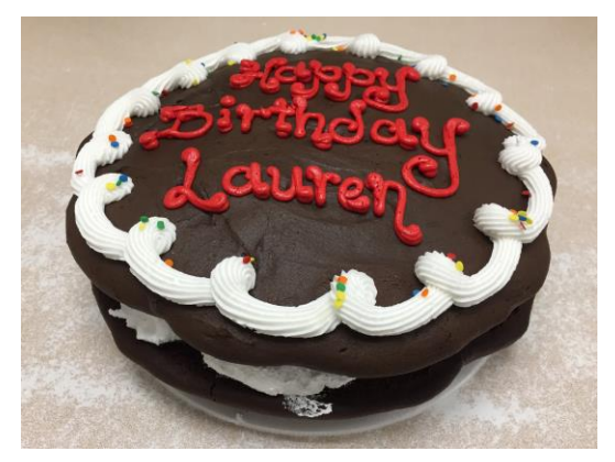
8" WHOOPIE PIE CAKE (serves 8-10)