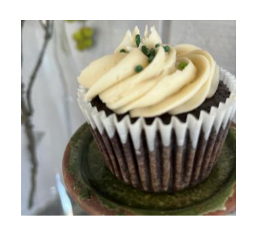
SPECIALTY CUPCAKE CAKES (please consult decorator)